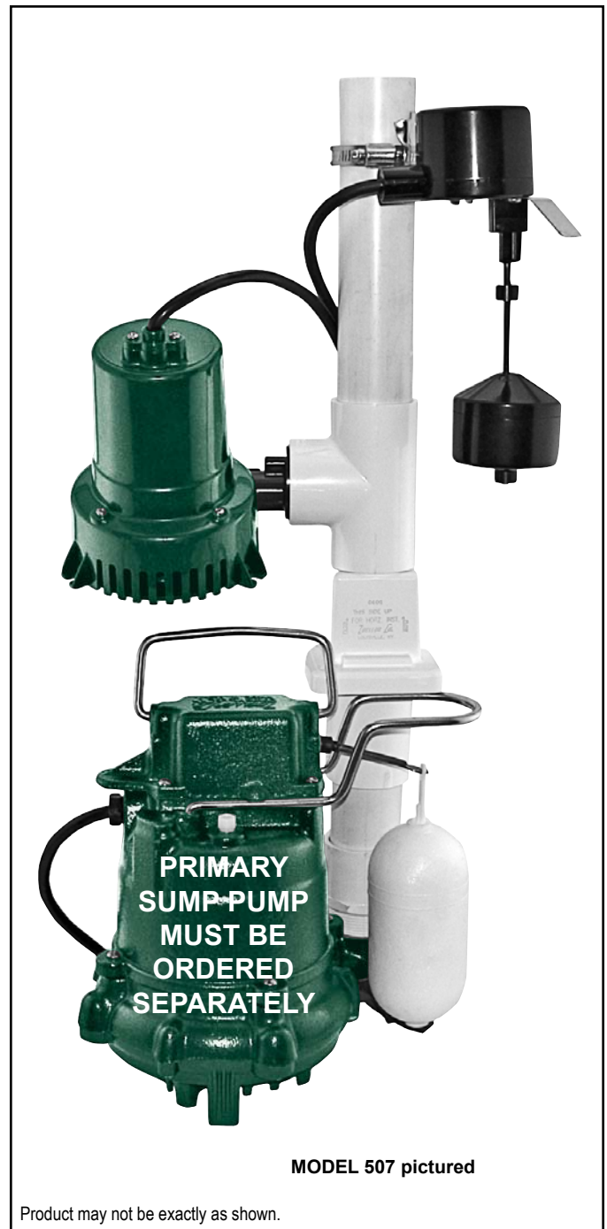
MODEL 507 pictured

FITTINGS: Furnished with ALL required fittings. Model 507 has an internal check valve in the discharge and includes an additional heavy duty check valve adaptable to 1¼" or 1½" pipe. Model 510 includes two heavy duty check valves to install with pedestal/column or submersible pumps.