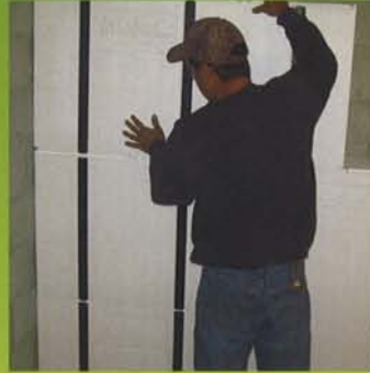
2. Press into Place