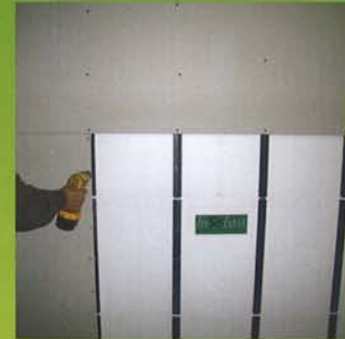
4. Install Drywall