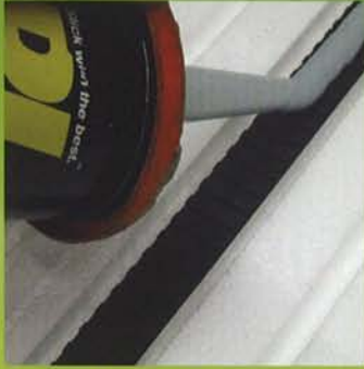
1. Apply Adhesive