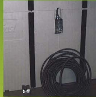
3. Run Electrical